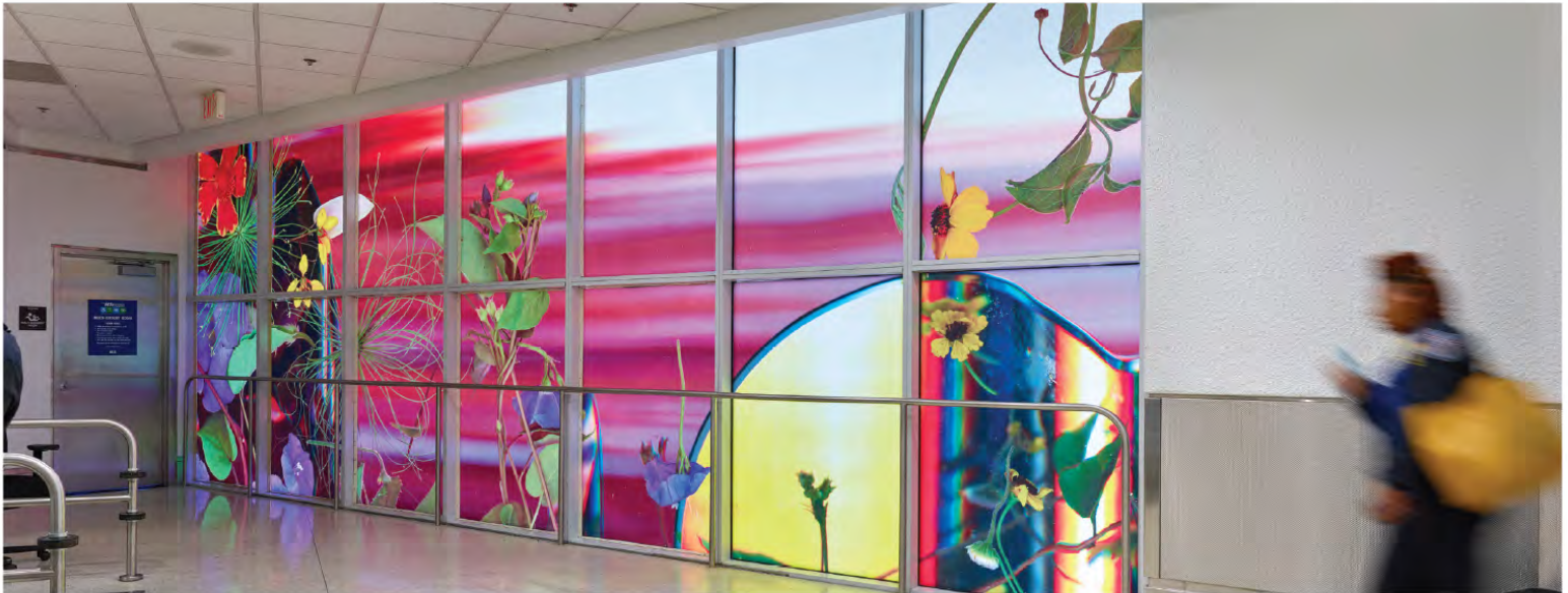
Installation view of Staging a Florida Sunset (October 15, 2020, 12:01pm), 2022, digital prints on translucent vinyl, 136 x 335 in.