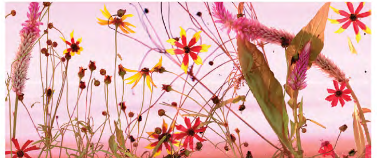
Coreopsis Study Part 2 (April 20, 2022, 11:20am), 2022.