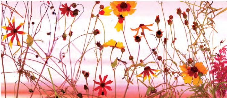
Coreopsis Study Part 1 (April 20, 2022, 11:37am), 2022.

"During the COVID-19 pandemic lockdown, the subject of my scans was drawn from my garden and study of South Florida's native plants. In addition to scanning the living plants, I also became fascinated with recording the sky and the sunlight and clouds' movement in the background. To my surprise, the sky in Coreopsis Study Part 1 (April 20, 2022, 11:37am) and Coreopsis Study Part 2 (April 20, 2022, 11:20am) recorded the sunlight as pink. Coreopsis is also known as Tickseed and is Florida's state wildflower."